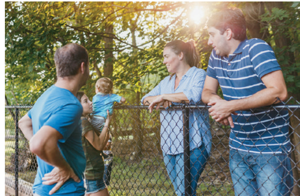
Smoke-free area policies change the social norm and promote smoke-free living.